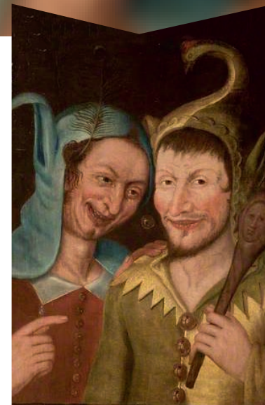
Ill. : Wee Three Loggerheads , c.1600-25. Oil on wood, 61cm x 40.5cm. Shakespeare Birthplace Trust